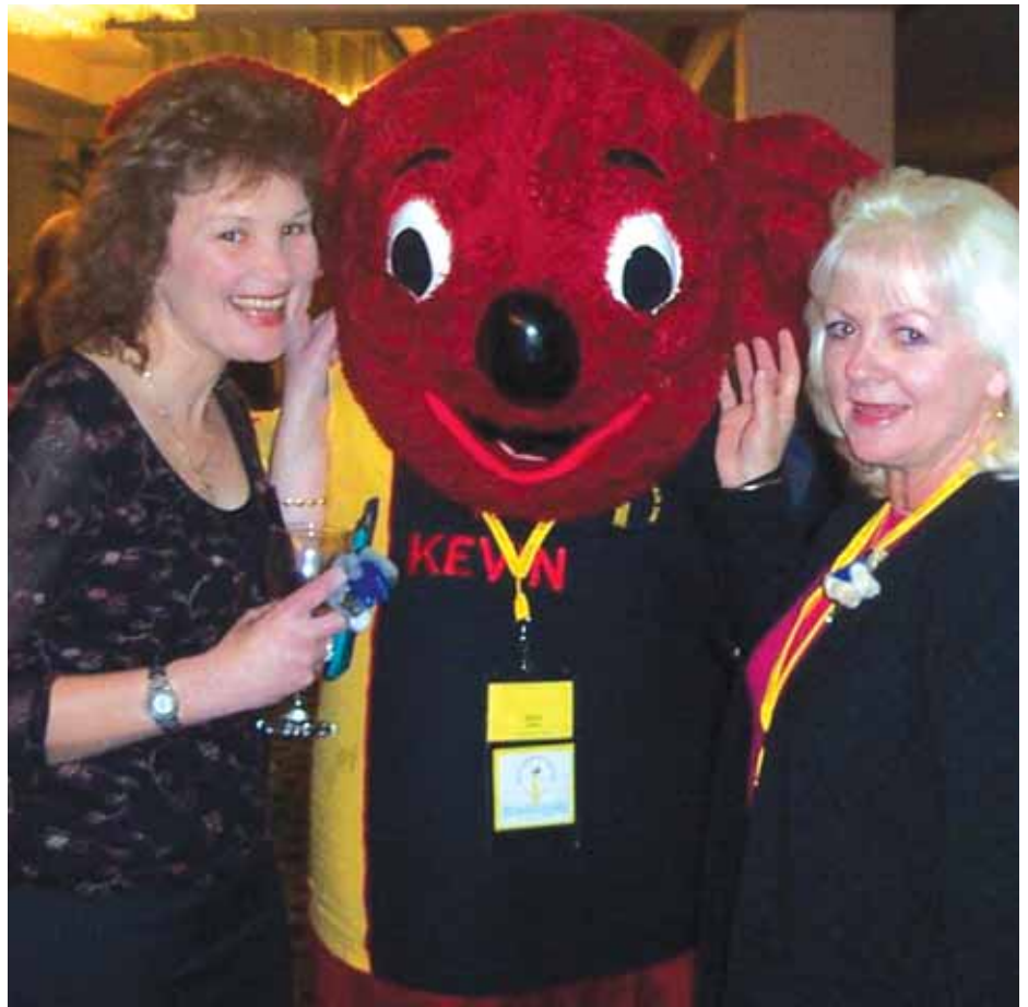
This is "Kevin the Koala"